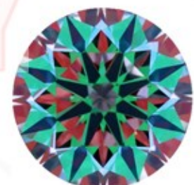
Optical Symmetry Excellent

Optical Symmetry Analysis: The colored areas of the symmetry image are indications of light handling ability, giving a visual representation of proportions and facet alignment.