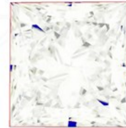
Optical Brilliance Excellent

Optical Brilliance Analysis: Brilliance is the overall return of light to the viewer. The brilliance image is a representation of (a) white areas of light return, or brilliance, and (b) dark-blue areas of light loss.