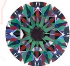
Optical Symmetry Excellent

Optical Symmetry Analysis: The colored areas of the symmetry image are indications of light handling ability, giving a visual representation of proportions and facet alignment.