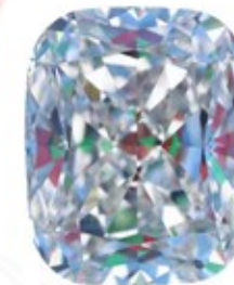
Optical Symmetry Very Good

The colored areas of the symmetry image are indications of light handling ability, giving a visual representation of proportions and facet alignment.