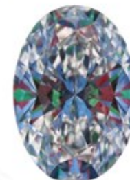
Optical Symmetry Very Good

The colored areas of the symmetry image are indications of light handling ability, giving a visual representation of proportions and facet alignment.